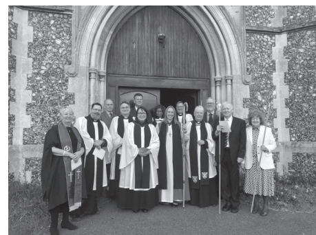
Gathering outside the church, including Churchwardens, Clergy and Patron's Representatives