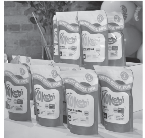
The Kokebi Coffee range of blends

Kokebi Coffee is set apart by their unwavering commitment to taste and quality. They source speciality beans from the most reputed farmers the world over, renowned for their smooth flavour and aromatic profiles. Whether you prefer a rich and robust blend or something a little more delicate, Kokebi offers a delightful variety to explore. With seven different blends to choose from, including their smooth organic and decaffeinated options, there's a perfect cup waiting for every palate. Kokebi also offers exciting seasonal, single-origin coffees, including the unique notes of their Colombia Huila and Rwanda Gisuma blends, showcasing the distinct character of their origin.