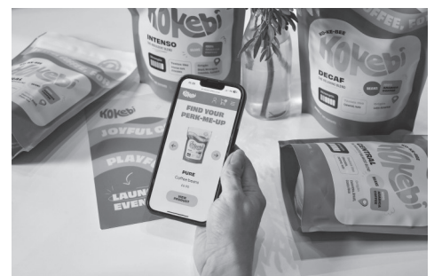
Order Kokebi Coffee online to your door

bring a little more joy into your day, one delicious cup at a time. So, why not treat yourself (or a loved one) to the simple pleasure of truly exceptional coffee? You might just find your new favourite brew right here in our local community!