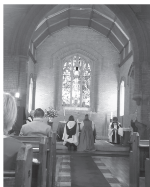
The Institution by the Bishop of Hertford