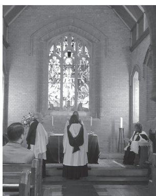
Declaration of Assent and Oaths

Thank you to everyone involved in the planning, preparation and running of the event.