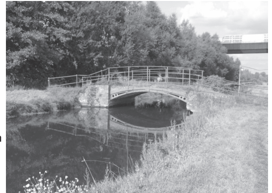
Between New Gauge & Chadwell Springs looking downstream