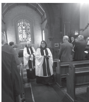
The Induction and Installation by Archdeacon of Hertford