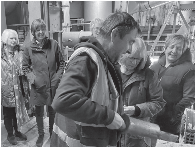
Gain full access to the heart of our operations

The summer seasonal tour is especially for those who are eager to deepen their knowledge of our local history and the significant role French & Jupps, and the community in the three villages, has played in the region's agricultural and brewing heritage, which remains to this day a vital aspect in both British and transatlantic brewing.