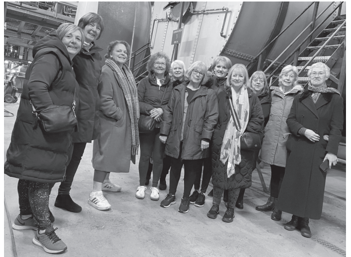
Tours open to residents of our local community