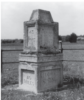
Chadwell Spring, 1930s

Colthurst had not been idle during those early years as in 1602 land surveyors were seen in St Margarets. By the end of that year Colthurst had the full course of his proposed river mapped out. The route he devised ingeniously followed the 100-foot contour line and needed to be about 42 miles long to cover the actual distance of some 20 miles. The gradient of the channel was just 4–5 inches per mile and the channel, as laid down in the Letters Patent, was to be 6 feet wide and 4 feet deep. Given the relatively primitive surveying instruments available at the time, it was a tremendous achievement to survey the route so accurately and then ensure its subsequent construction met these requirements.