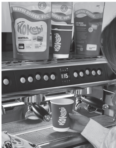
Kokebi Coffee served by Logic Vending

While they might be a newer name to some, Kokebi Coffee has a rich history of quietly caffeinating coffee lovers for over 30 years. Starting out by supplying coffee machines through Logic Vending, Stanstead Abbots, they soon realised that what truly mattered to their customers was the taste of the coffee itself. This revelation led them on a global quest, travelling and tasting to find beans that everyone could agree on – simply the best.