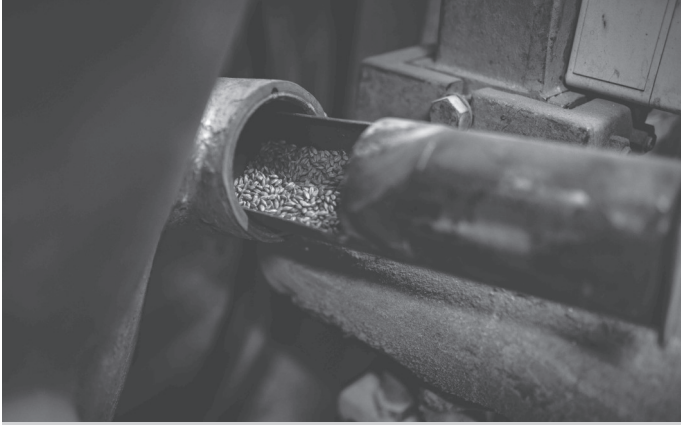
French & Jupps handcrafted roasted malts

French & Jupps extends a warm and unique invitation to the residents of our local community here in the three villages to explore French & Jupps, Great Britain's oldest maltster.