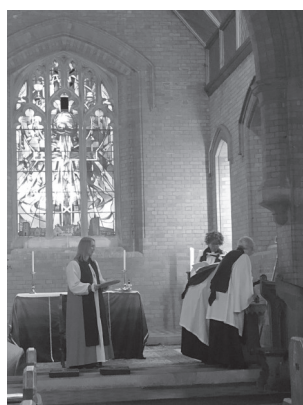
Signing the Declarations